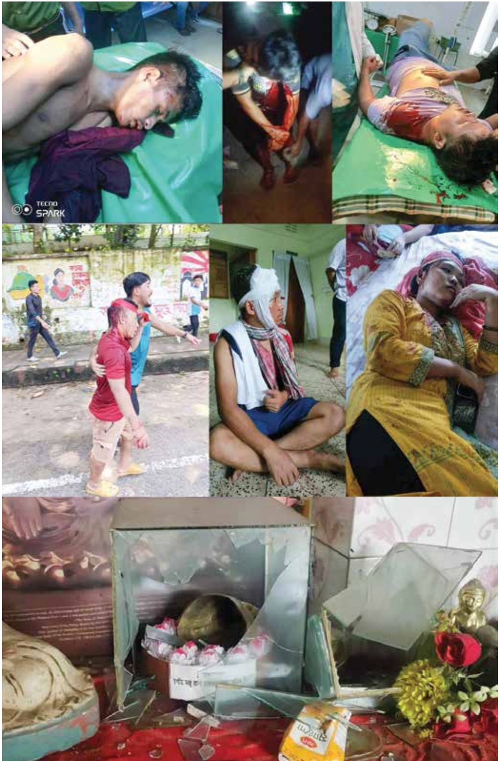
Photo of communal attack took place in September 2024