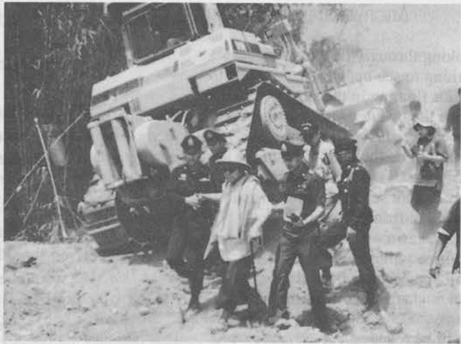
Sulak Sivaraksa was arrested in the jungle on March 6, 1998.

As we can now envisage what is right and what is wrong I hope the Thai government will be courageous enough to pursue justice, the decision of which will eventually bring us honor and pride.