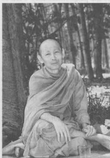
Phra Paisan Visalo

Consumerism rests on the principle that happiness and success come about through consuming or purchasing things, not through creating or realizing it by