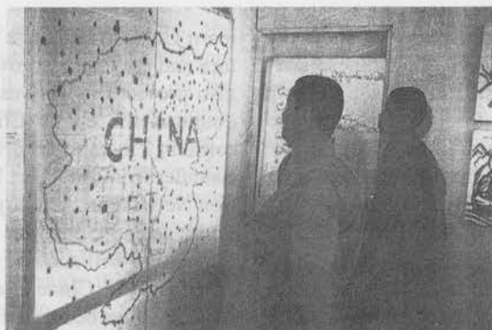
Monks participating at the opening of the World Artists For Tibet exhibition on July 5.