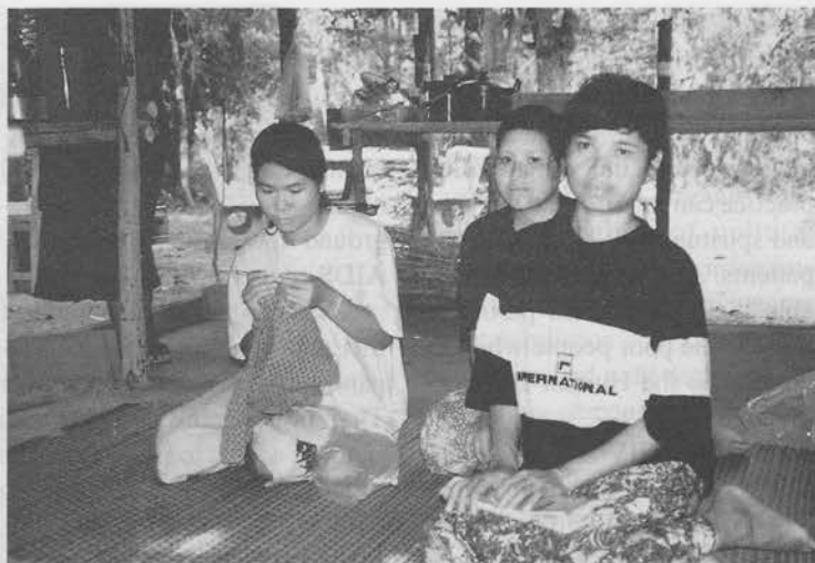
Women living with HIV/AIDS at Wat Thammasatorn Angarika, Nong Saen