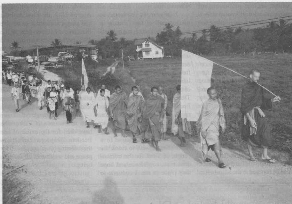
Walkers at the Third Dhammayietra near Hat Yai

China, and complex urban settlements dating from at least 1000 years ago. The introduction of wide-scale rubber planting was the earliest of the dramatic human transformations of the lake region in this century. Such transformations have accelerated in the last 30 years. The city of Hat Yai has grown to become the financial and commercial center of Thailand's southern region. Together with Songkhla, it supports an export industry based on two of Thailand's major trade products—rubber and seafood. Shrimp farming has expanded rapidly in the lake region, as have the areas under rubber cultivation. Numerous seafood and rubber processing plants have sprung up as well around Songkhla and Hat Yai.